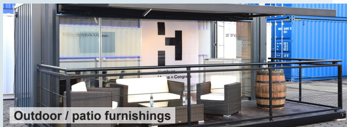
Illustration of extras