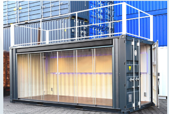
Illustration shows optional equipment available at an extra fee